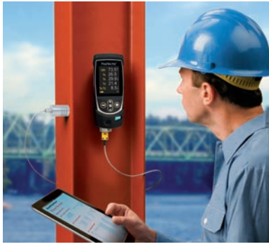
Analyze Readings using a web browser from anywhere - jobsite or head office.