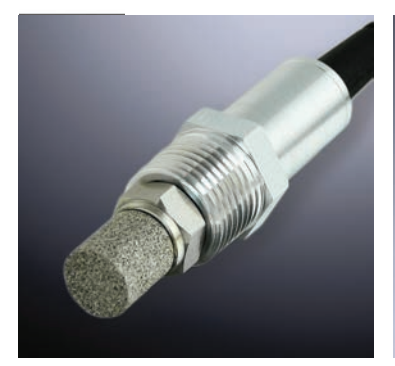
for insertion into pipes (max 100 psi).