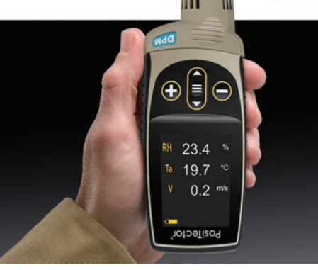
PosiTector DPM A shown with NEW Auto rotating display with Flip Lock.

Hot-wire anemometer with your choice of wind speed measurement units — m/s, km/h, mph, ft/s, ft/m, knots. DPM A models only.