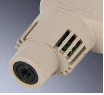
PosiTector DPM D includes 1/2" NPT threads PosiTector DPM IR probe includes a noncontact infrared surface temperature sensor.